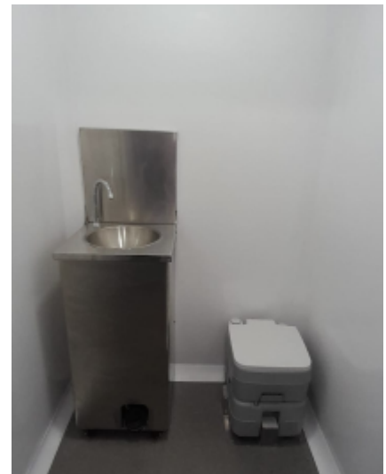
The independent sanitary module with stainless steel sink and portable sanitary unit — clinical-grade hygiene conditions anywhere in the country.