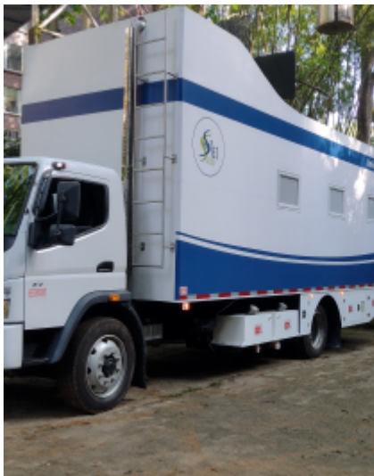
The completed unit ready for service: NINOX coachwork on a Mitsubishi Fuso F1 chassis, carrying the SIES Salud identity in a tropical Colombian setting.

The lateral expansion module radically transforms the perception of the interior once deployed: what appears from the outside to be a conventional-sized truck becomes, when parked and extended, a well-organized and spacious medical workspace. This design reflects a philosophy NINOX has refined across dozens of builds: form follows function, and function is always the dignity of the service being delivered.