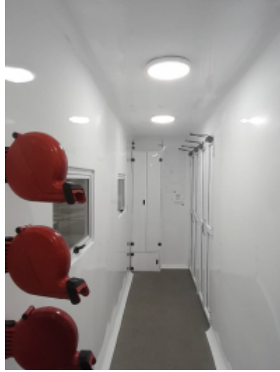
The unit's central corridor, showing the full depth of the interior with recessed LED lighting, compartment doors, and sanitary-grade finishes.