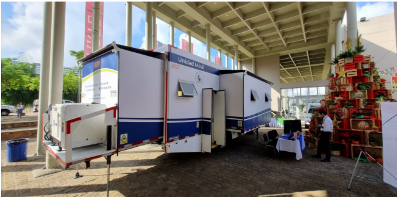
The unit deployed at a community health event, with its expanded module open and medical staff attending to the public.

The need was simultaneously technical and human. A basic medical transport vehicle would not suffice. What was required was a unit that projected trust and professionalism, that contained the clinical spaces needed for a complete consultation, and that could operate autonomously in locations without hospital infrastructure. That was the level of demand placed before NINOX Corporation.