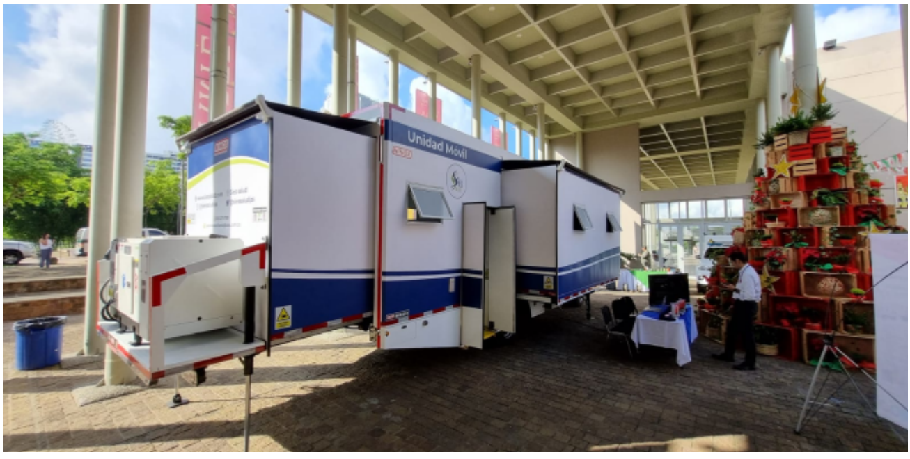
The unit in operation at a community health event, with staff and equipment fully active — the mobile clinic model in action.

For NINOX Corporation, this project reaffirms the purpose at the core of every build: designing and constructing specialized vehicles that do not merely satisfy technical specifications, but enable fundamental human missions. Building a clinic that travels is building access. And in healthcare, access is life.