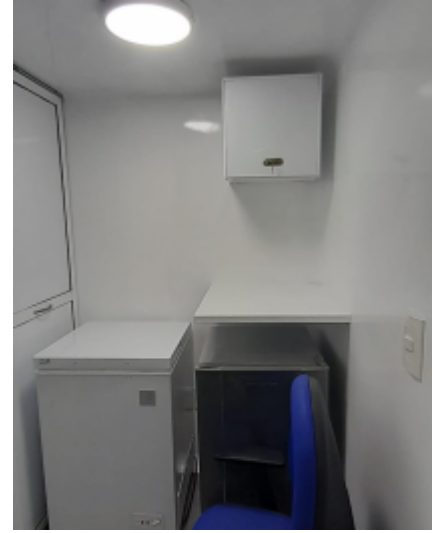
Sample storage and work area, featuring a chest refrigerator, laboratory countertop, and overhead medical supply cabinet.