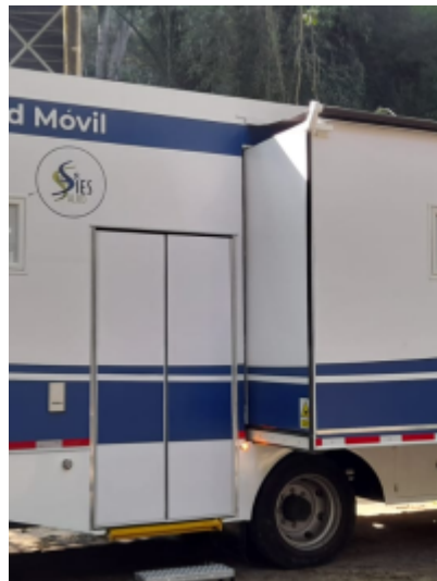
Rear-lateral view of the unit with the expansion module fully deployed, revealing the scale of operational space available in the field.