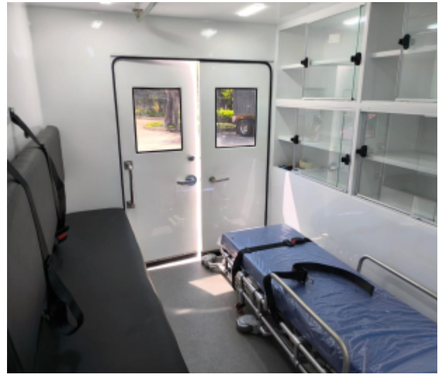
Double rear access door with clinical-spectrum LED lighting