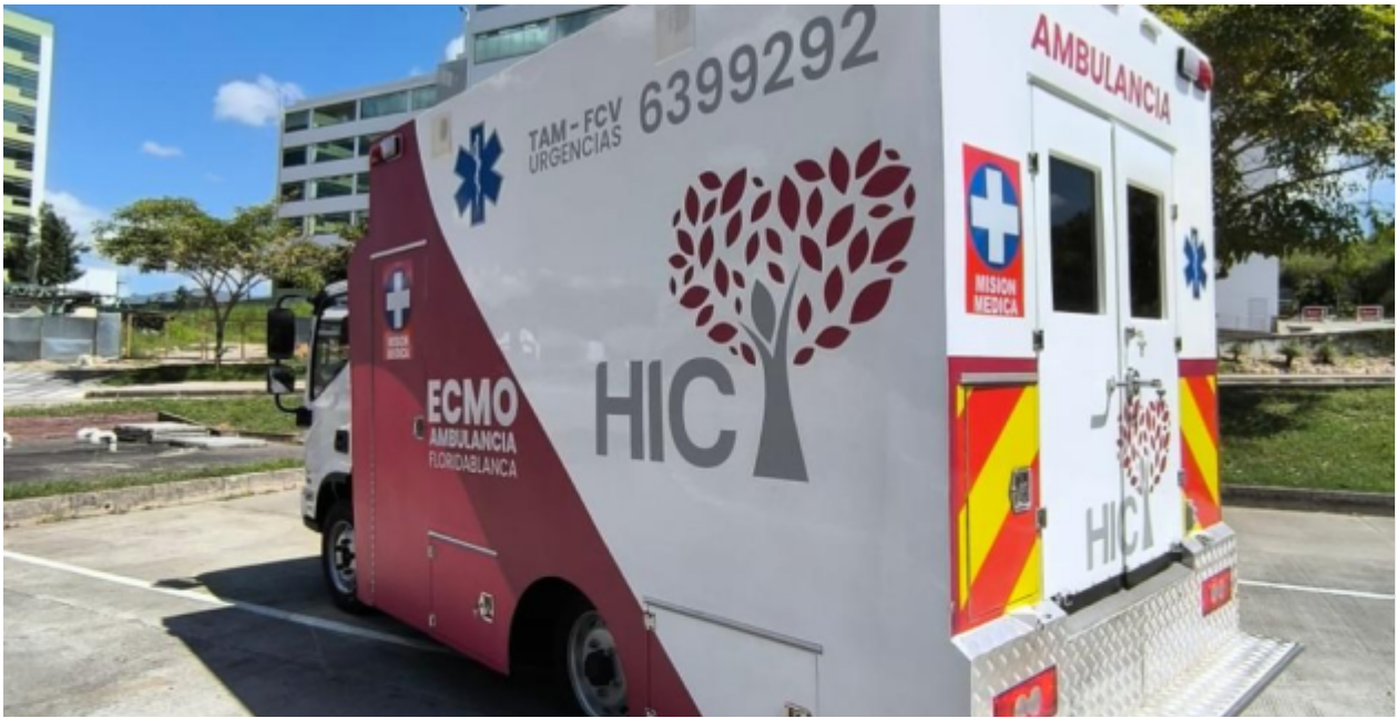
Official handover: the ECMO Ambulance ready for its first mission in Floridablanca

In that silent, urgent journey — monitors lit, ECMO equipment in rhythm, the medical team focused — is written the reason this project exists.