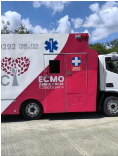
Lateral view: the HIC ECMO Ambulance in its distinctive institutional crimson

The lateral crew bench allows the ECMO team — an intensivist physician, a perfusionist nurse, and a medical assistant — to travel alongside the patient in optimal working conditions. Nothing is improvised: every centimeter of the module was designed for emergency response.