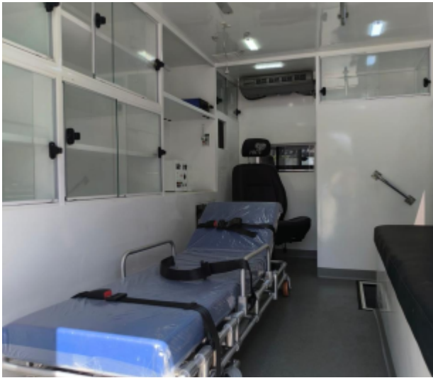
Medical module interior: glass cabinets for ECMO supplies and certified stretcher

A certified stretcher, a medical air conditioning system, secured crew seating, and ECMO equipment anchor points complete a treatment room that simply travels to wherever the patient needs it.