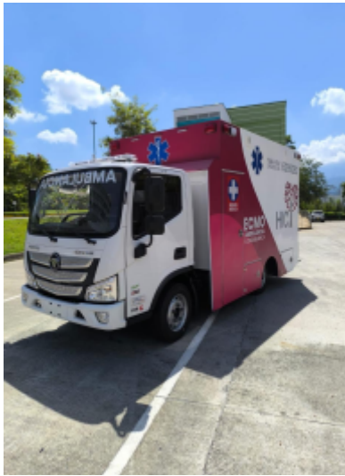
Front view on Foton Aumark chassis — an imposing presence on the road