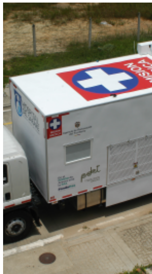
Aerial view of the blood bank unit showing the Medical Mission marking on the roof, visible from the air to ensure the vehicle's protection under International Humanitarian Law.