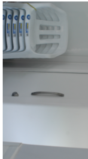
Unit interior showing medical equipment and clinical storage systems integrated into the NINOX-fabricated bodywork.