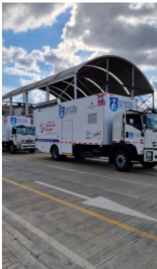
Both FondoPaz PDET Arauca program units in formation: the blood bank and gynecological unit, ready to be deployed into the peace territories.

The Mobile Blood Bank is equipped for donor recruitment, whole blood extraction, blood component processing, and refrigerated storage. Its side awning deploys to create an open-air waiting area, and the rear access ramp allows donors with reduced mobility to board without barriers. The Gynecological and Mammography unit houses a diagnostic mammography machine inside — the first contact with this type of equipment for thousands of women in Arauca — alongside a fully equipped gynecological clinic with examination table, clinical lighting, and complete privacy. Both units operate as compact hospitals: energy self-sufficient, climate-controlled, and certified to deliver third-level health services in open-field conditions.