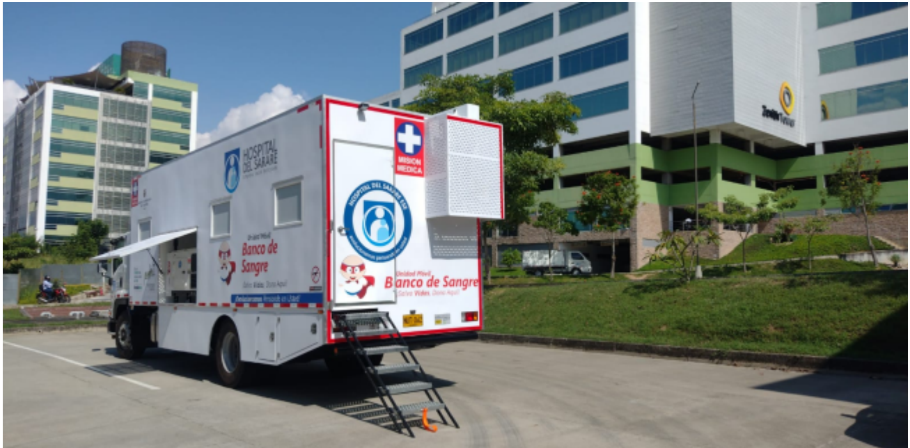
Side view of the blood bank with awning deployed and entry open, ready to receive donors in the field.

The Mobile Blood Bank and the Gynecological Mammography Unit are also a commitment to prevention: reproductive health and blood availability are two of the most critical links in any rural health system. Their absence has cost lives. Their presence — lasting, periodic, mobile — changes the equation. NINOX built the units. Peace put them on the road.