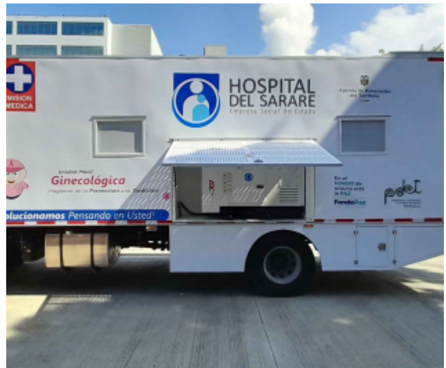
Mobile Gynecological and Mammography unit with white bodywork bearing the Hospital del Sarare institutional graphics and FondoPaz program logos.