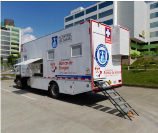
Mobile Blood Bank unit with access ramp deployed and side awning extended, ready to operate in the field.

For the gynecological and mammography unit, the challenge was even greater: integrating a diagnostic mammography machine — precision optical and mechanical equipment requiring an anti-vibration platform, stabilized electrical connection, and structural shielding — inside a mobile bodywork that also had to house a complete gynecological clinic with privacy, clinical lighting, and functional space for both patient and physician. NINOX resolved each of these requirements with thermoplastic aluminum bodywork, sanitary flooring, zoned climate control systems, and a backup generator integrated into the lateral compartment of each unit.